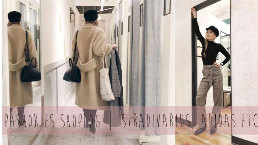
PASHOKJES SHOPLOG AMSTERDAM 20.000 views