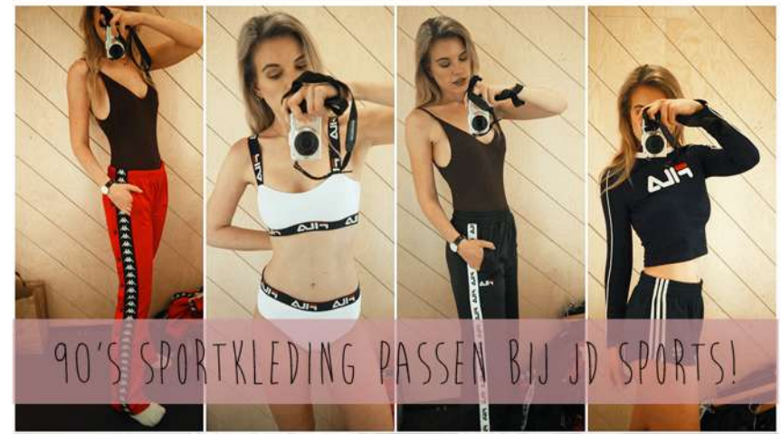
JD SPORTS PASHOKJES SHOPLOG | 90'S STYLE 14.000 views