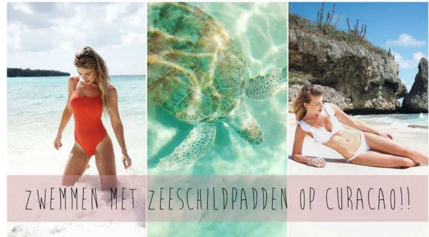
CURACAO 2018 TRAVEL VLOG 8.000 views