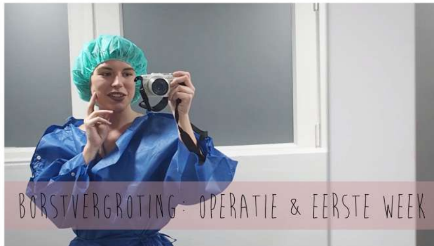
MIJN BORSTVERGROTING: DE OPERATIE EN EERSTE WEEK 27.000 views